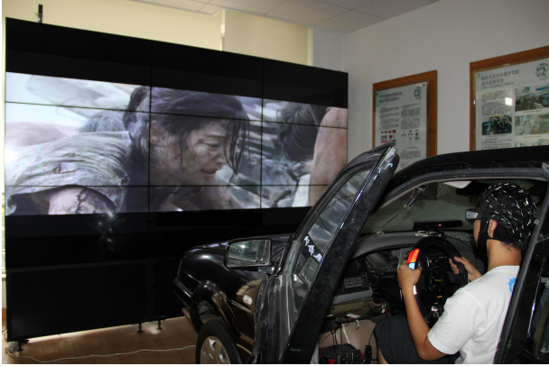
Fig. 1. The experiment scene. (One of our study motivations aims to enhance driving safety via recognizing and adapting to drivers' emotions. So we utilize a driving simulator in the lab, which has a relatively closed environment.)

We selected the subjects using the Eysenck Personality Questionnaire (EQP). EQP is a questionnaire to assess the personality traits of a person as three dimensions of Extraversion/Introversion, Neuroticism/Stability and Psychoticism/Socialisation devised by Hans Eysenck et al. [7]. We tended to select subjects who are extraverted and have stable moods from the feedback of questionnaires. Subjects were informed about purposes and procedures before the experiments. Fig. 1 shows the experiment scene.